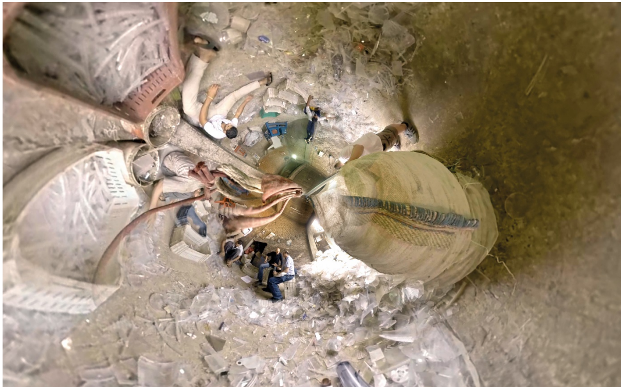
Figure 4: The philosopher Graham Harman about new materialism in the middle of waste, smell and noise in the Garbage Village of Cairo. WASTELAND , 2016.

The WASTELAND project dealt with the question of how matter, organisms and geographies in the age of the technosphere can be thought of as a relational connection on a level with the human being. This artistic research focuses on the use of resources in relation to two waste recycling systems in Cairo and southern Baden.