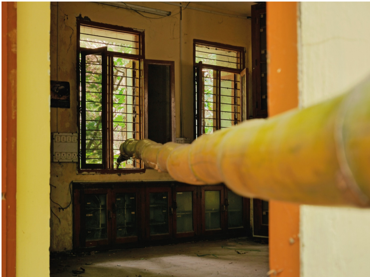
Figure 3: Parasitic intervention at the Centre for Ecological Sciences, IISc Bangalore/India. BUZZ , 2014.

The follow-up project BUZZ consists of two parts: one in a South Indian insect laboratory ( Phase I , 2014) and in a folding installation in Freiburg ( Phase II , 2015). Both are centred on forms and concepts of the “parasitic”, as it was developed above all by Michel Serres.