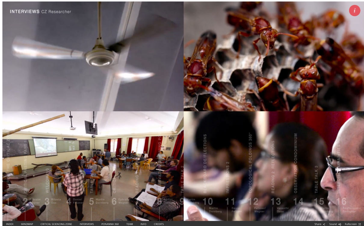
Figure 5: Parasitic Workshop and Interviews at CCS/IISc in March 2018; interviews with biologists and experts in the field of the critical zone. DE\GLOBALIZE , 2018.

which we respectively modified into quantitative and qualitative, immersive-conversational, explorative-consumptive, embodying-enactive-experimental and participative-interactive levels or elements. In our current research DE\GLOBALIZE we explicitly develop and explore an additional “improvisational mode”.