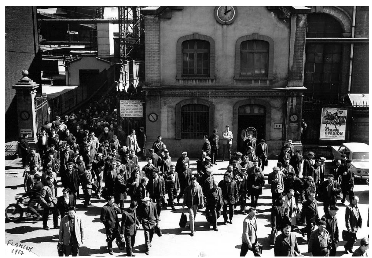
Figure 1: "La Grande évasion" ("The Great Escape"). Workers leaving the Usine de Senelle, Longwy. Photograph Bernard Flamion, Mont-Saint-Martin, 1967.

With the availability of sociodemographic data on the local population through municipal archives, the historical study of that ecosystem needed to establish the geographical location of the cinemas, to identify all the films released in Longwy during the 1950s and their box offices. A detailed analysis of the archives of the Centre national du cinéma, which centralises information from each cinema operating within French territory and their daily