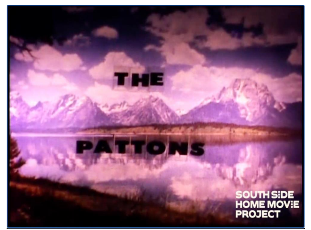
Figure 1: "Title cards." Vacation (1966) Titles . 1966, 8 mm colour film.

The Patton home movies also display remarkable attention to detail and forethought in documenting the family's experiences, as demonstrated by the title cards they created for their films. These do-it-yourself title cards, created on Super 8 mm film, feature cut-out letters pasted onto picturesque backgrounds of lakes and mountains (Fig. 1). The Patton home movies' meticulousness, as evidenced by their customised title cards and filming techniques, provides insights into their film practice. The deliberate use of title cards demonstrates a high level of commitment and investment in their filming. It reveals that they approached filmmaking with a semi-professional or at least very dedicated attitude, valuing documentation and presentation. The DIY nature of the title cards, with cut-out letters set against captivating backgrounds, also offers a window into the couple's creative spirit and collaborative efforts. Creating these films probably became a cherished family activity, fostering bonding and a collective memory-making process. Overall, this level of dedication in documenting their travels demonstrates their belief in the importance of preserving and sharing the tourism experiences of African Americans.