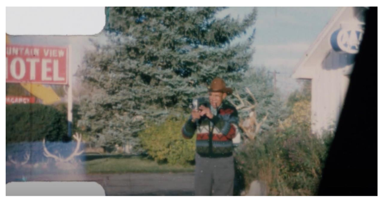
Figure 3: "Man with a cowboy hat taking pictures." 014_AAHMA . 1960s, 8 mm colour film.

Westerns transcended boundaries like gender, class, and race, promoting the West as the foundation of American identity (Rugh 94). In 1959, about 25% of TV content was Westerns. By 1960, they captivated more than a third of all TV viewers, with eight out of the top ten shows being Westerns (92). However, the rise in popularity of Westerns during the mid-twentieth century was not confined only to professional programming. This national fascination is also reflected in the personal visual records of the era. A home movie from the AAHMA collection provides a glimpse into this phenomenon ("014_AAHMA"). The 20-minute and 31-second orphan home movie depicts African American tourists as they embark on a road trip to the Western US during what appears to be the early 1960s.