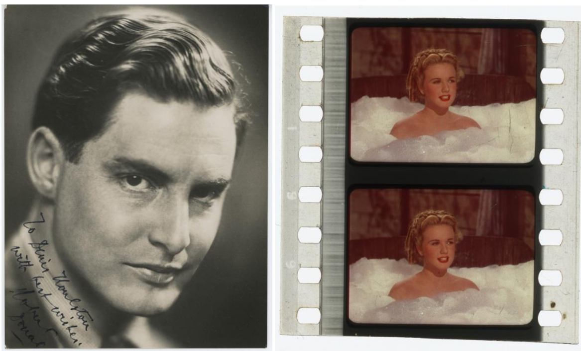
Figure 6 (left): Robert Donat Autograph from 1933 sent to Denis Houlston. Figure 7 (right): 35mm offcut: Deanna Durbin in Can't Help Singing (1944).

It has been of crucial importance to strike a balance between managing the collection for the physical and for the digital archive presented through the CMDA website, Lancaster University's library catalogue and Lancaster Digital Collections. From a traditional archival perspective, the need to fully survey, index and preserve the physical materials takes precedence, whereas now, within the digital humanities field and for CMDA, the digital aspect and the need for preservation and presentation of the digital materials are the overriding objectives. Although the archiving and display of the material within the Special Collections area needed some consideration, the presentation of the digital materials has been instrumental in informing the overarching approach and structure of the collection. Primarily, it more readily enables, and makes visible, the interconnectedness of the materials, and will also facilitate findings emerging from the QDA process to be fed into the functioning of the search engine. Records and display of the material nevertheless have needed to be adjusted to the specifications of the individual platforms and differentiating between the varying requirements has proved challenging at times. Transparency and consistency, both in view of the system and in detailed documentation of the progress, have therefore been essential in maintaining an overview over the development of the archive.