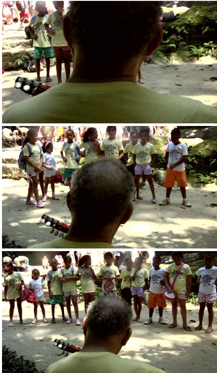
Figures 4–6: Kids slowly gathering around Jards Macalé while he plays in O PATO • a very short portrait of JARDS MACALÉ. Petites Planètes . Screenshots.