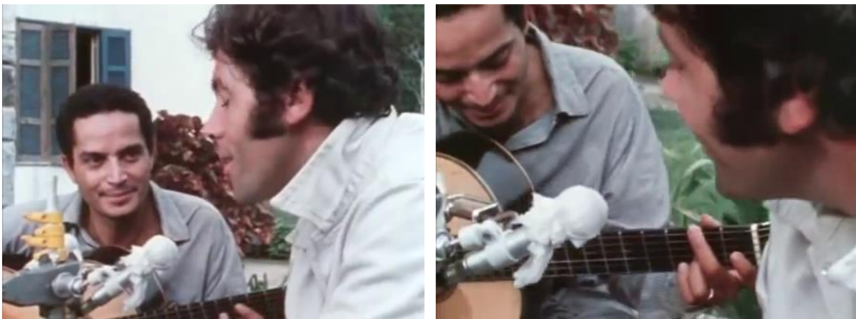
Figures 13 and 14: Baden Powell and Pierre Barouh singing “Samba Saravah” in the last sequence of Saravah.

By contrast to the final bar scene in JOSÉ DOMINGOS is Barouh’s performance of his own adapted version of “Samba da bênção”. With an improvised mic stand and a predominantly French performance, Barouh sings while Powell plays the guitar and occasionally joins in with the vocals. Similar to Moon’s film, “Samba Saravah” (the name Barouh gave to his version) appears in the last sequence of the film and the French director makes use of the song to thank all of the musicians that inspired him and those who helped make the documentary possible. So, what is the difference between two similar sequences that are separated by four decades?